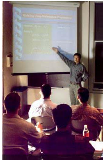
Prof. Z-L Chen describes mathematical programming methods for solving vehicle routing and scheduling problems.

Cross-docks (x-docks) represent a new concept in distribution systems. In x-docking, trucks pick up scores of smaller shipments destined to widely spread locations to make a full load at a factory or warehouse. They then travel to a rendezvous point and there swap shipments with other trucks. They retain the shipments for a small geographic area, and then make the deliveries. This replaces a system where each truck would take all the shipments it picks up originally to the required destinations, which might be spread over a very large area. Thus each truck would travel much farther, increasing the cost of delivery, taxing the driver with long hours, wasting more fuel, and ultimately costing the consumer more money.