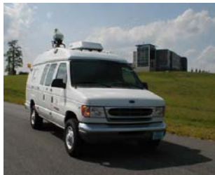
VTTI's Mobile Traffic Lab

As the largest research division at Virginia Tech, the Virginia Tech Transportation Institute (VTTI) brings together a multidisciplinary group of researchers and students to conduct cutting-edge transportation research. VTTI participates in partnerships with public and private agencies and industry to develop, test, and deploy new transportation systems in the areas of safety, pavement, traffic, road-to-vehicle communications, and traveler-information systems.