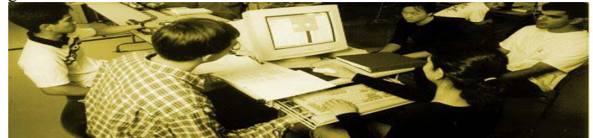
The Supply Chain Game at Penn

This lab is deliberately different. It draws its inspiration from laboratories in the physical sciences where students work with the real material or physical system. Now, of course, one cannot bring a real supply chain into the lab, nor can one allow students to manipulate a real production system. But a small version of such a system can be built. Instead of real goods, one can use blocks representing products at various stages and have these items flow between the factories through the warehouses to the retail stores where they can vanish as virtual customers buy them. Real size limitations can be imposed on warehouses, and time can be taken transporting things from one stage to the next, though only minutes instead of days are taken. Result: a miniature supply chain, with—you guessed it—model trains carrying the goods from one location to another.