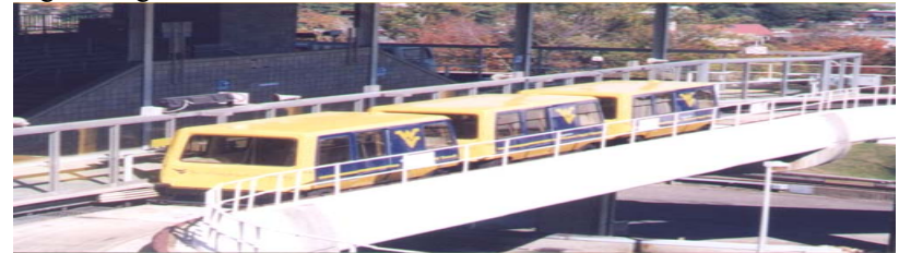
WVU's People Mover

Public service is one of the center's primary missions, in concert with WVU's role as the land grant institution for the state. The center strives to ensure that benefits of research extend beyond the solving of technical problems. Through the technology transfer center, routine training sessions are held for transportation engineering and maintenance personnel. Faculty and researchers serve as technical and educational support to state agencies, legislature, municipalities, and private citizens. In addition, the research program provides the primary support for graduate students while they pursue their studies a tremendous investment in the future of transportation engineering.