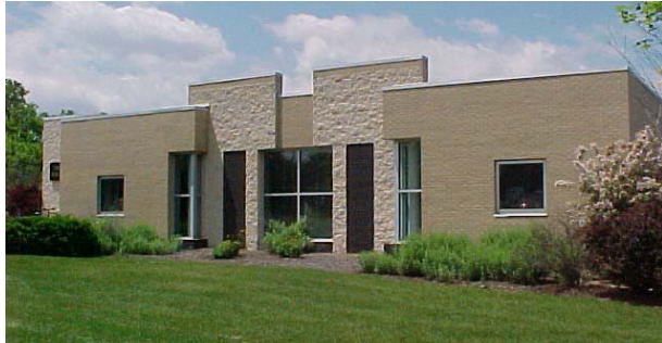
The Pennsylvania Transportation Institute

Penn State's Pennsylvania Transportation Institute (PTI) is an interdisciplinary research unit within the College of Engineering. Since its inception in 1968, PTI has aspired to conduct innovative and relevant research directed toward current and future transportation needs, to promote continuing